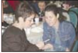
Reading prayer requests