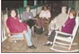
Talking and rocking