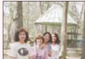
Posing for pictures at Camp Kulaqua's zoo