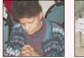
Helping build the Prayer Place

—MARK YOUR CALENDARS! NEXT YEAR'S HISPANIC WOMEN'S MINISTRIES RETREAT: FEBRUARY 28-MARCH 2, 2003—