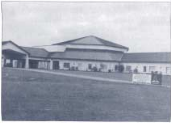
East Pasco Seventh-day Adventist Church, 7333 Dairy Road, Zephyrhills

ZEPHYRHILLS SUN • Thursday, January 31, 2002 • Page 5B