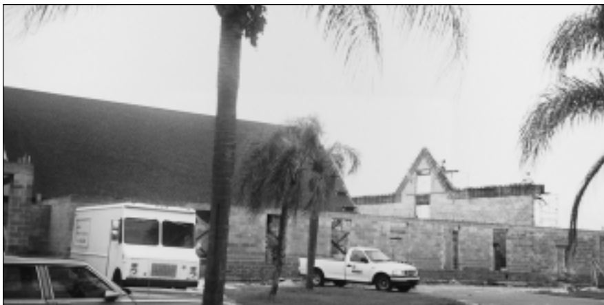
The Port Charlotte church at 2036 Loveland Blvd.